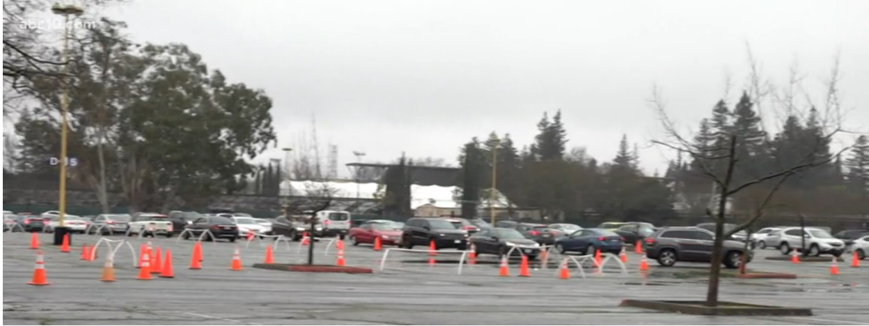
Drivers Line Up at Cal Expo for COVID-19 Vaccination